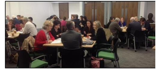
Participants discuss issues at our Roundtable

"Framing is the architecture of meaning through which we understand and communicate the world (and our values)"